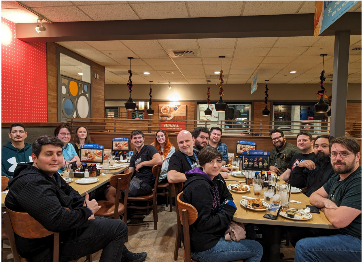
HKC BlizzCon 2023

Thank you for taking the time to read and adhere to these policies. We look forward to many more years of HKC and our community thanks to you!