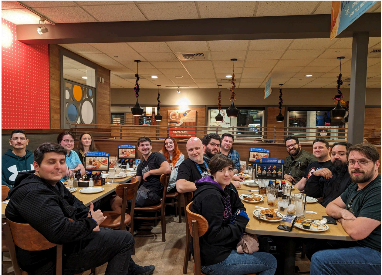
HKC BlizzCon 2023

Thank you for taking the time to read and adhere to these policies. We look forward to many more years of HKC and our community thanks to you!